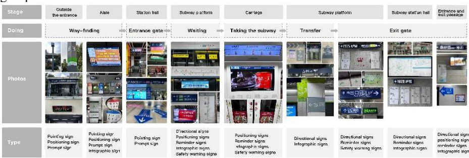
Fig. 2. Current status of Wuhan subway guide information distribution

1. Errors are easy to occur during the ride, especially at stations that require changing floors; 2. The legibility of the guide screens in subway carriages needs to be improved; 3. There is a lack of information design that considers vulnerable groups.