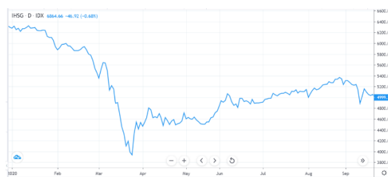
Figure 1. IDX Composite movement in 2020.

Entering the era of the COVID-19 pandemic in 2020, the movement of the IDX Composite Index fluctuated wildly, as shown in Figure 1.