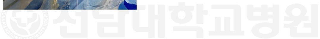
Figure 3. Radiologic measurement of femoral and tibial implants. \alpha , coronal inclination of femoral component, \beta coronal inclination of tibial component, \gamma sagittal inclination of femoral component, \delta sagittal inclination of tibial component